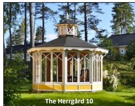
The Herrgård 10